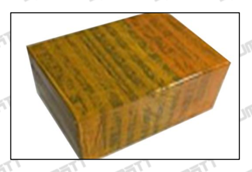
Pic No. 5 International Express Packaging: Wrapped with yellow tape after wrapping black protective film