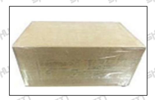
Pic No. 4 Domestic Express Packaging: Wrapped with transparent tape

▲ Minors are prohibited from using transparent tape, yellow tape, black wrapping protective film, and white wrapping protective film to avoid personal injury.