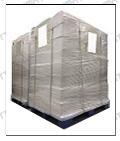
Pic No. 6

Pallet Shipping: Use pallet that meet export requirements, and use white wrapping protective film to wrap and bind with cable ties