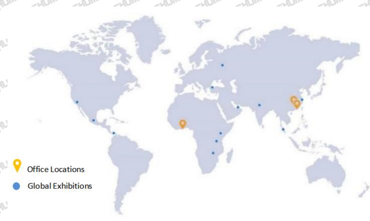
Pic No. 7